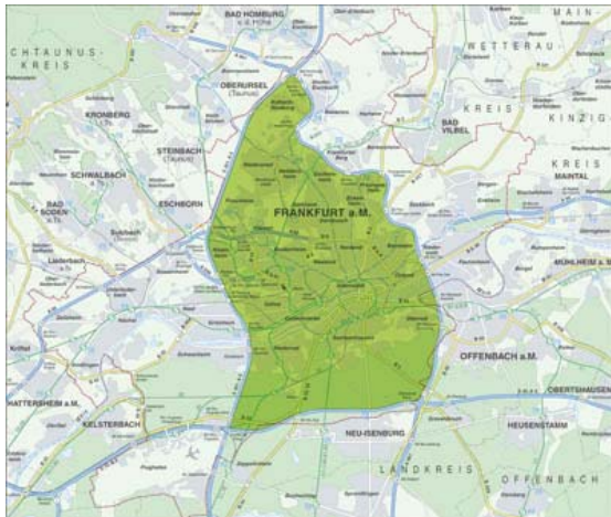
Frankfurt am Main Low Emission Zone

The low emission zone in Frankfurt is located within the motorway ring road comprising the motorways A5 in the west, A3 in the south and A661 in the east. (See map: Frankfurt am Main Low Emission Zone). Vehicles belonging to one of the relevant Pollutant Groups and bearing the corresponding pollutant badge can access the exhibition grounds at any time.